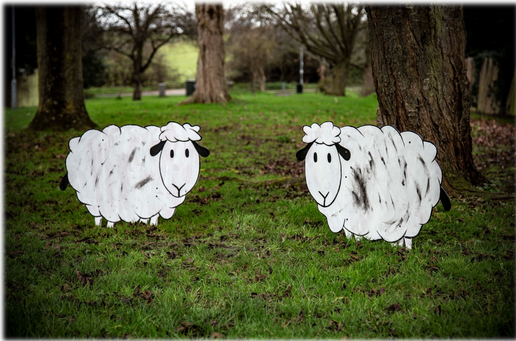
Lincoln Way— Lost Sheep