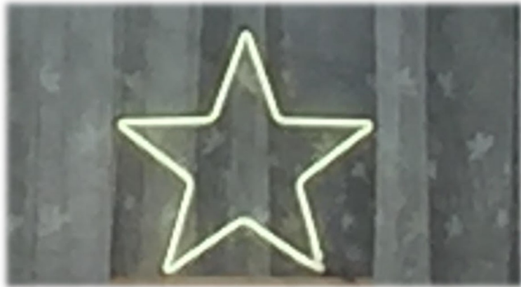
Goswell End Road — The New Star