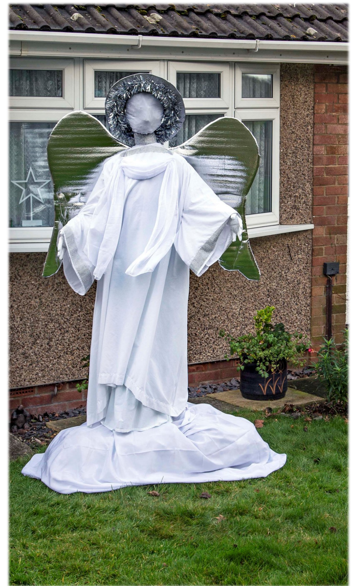
6. Top of Goswell End Road—